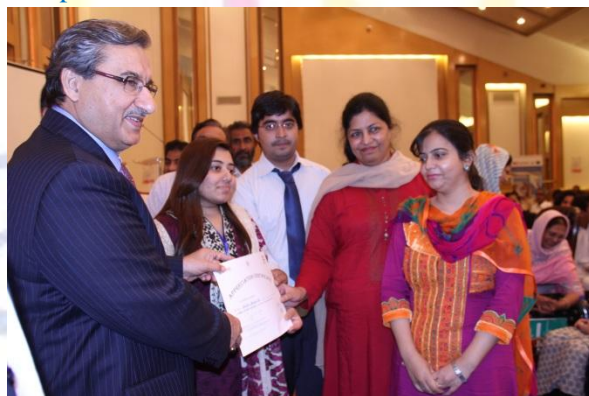
Prospective Teachers of B.Ed. Honors Elementary Class