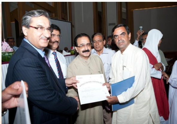
Presently Serving Teachers from Sukkur Region