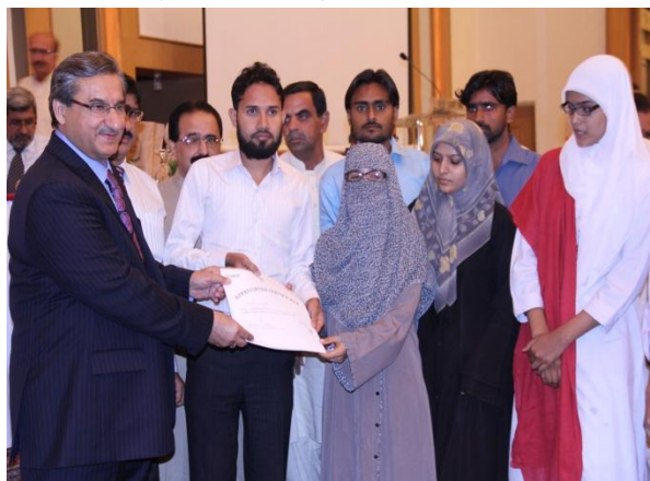
Prospective Teachers of ADE Class