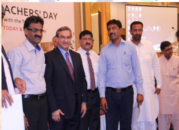
Presently Serving Teachers from Mirpur Khas Region