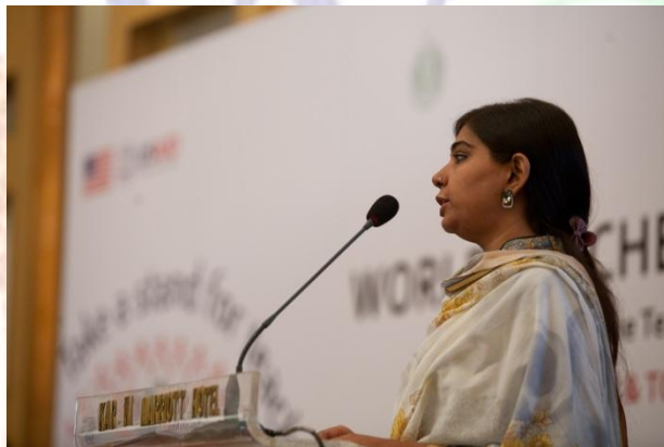
A government school teacher from Karachi region

Teams of primary school teachers, Junior school teachers and high school teachers who were nominated by each Director Schools Education of 5 regions, presented their experiences and assured that they would continue to work hard to be remembered as Teacher.