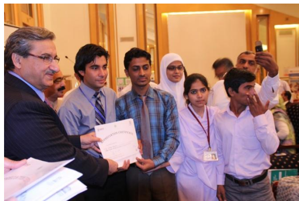
Prospective Teachers of ADE Class