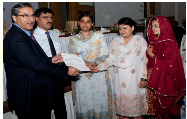
Presently Serving Teachers from Karachi Region