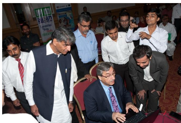
Pir Mazhar ul Haq, Senior Minister Education Sindh, is inaugurating to launch STEDA website.

Pir Mazhar ul Haq, Senior Minister & Minister to Government of Sindh Education and Literacy Department, then, inaugurated the official launch of STEDA website with web address of www.steda.gos.pk